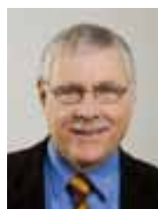
Dieter Imboden President of the National Research Council and the Equal Opportunities Commission of the SNSF

If we were to look only at the numbers, I would not dare to say that the efforts of the SNSF in improving equal opportunities have been an unqualified success: „She Figures“, statistics published by the European Commission, show that in terms of equal opportunity indicators Switzerland is average at best, sometimes even below average. But numbers do not tell the whole story. Ten years of work by the Equal Opportu-